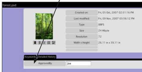
From the Data Fields tab, create and save the custom metadata into the XMP data of the Adobe file.

To see a video demonstration highlighting the use of XMP in the workflow, go to: www.xinet.com/marketing/xmp_demo.mov . The video will show how a custom metadata field in WebNative Admin can be used to write XMP metadata when approving a Photoshop image. After the file is approved, its XMP metadata, which was edited using WebNative Portal, contains user approval information when viewed in the Photoshop menu under ‘File Info.’